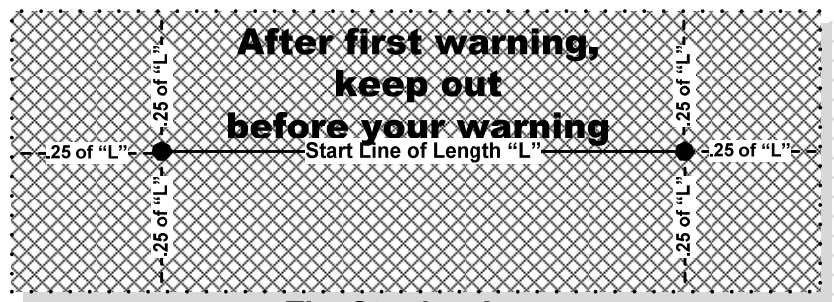
Diagram 1 The Starting Area